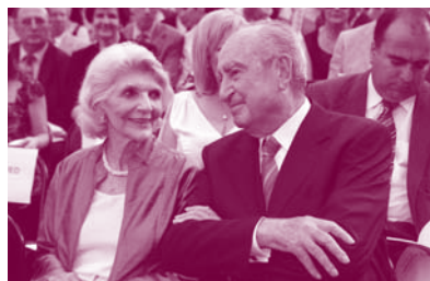
June 20, 2007, Annual Awards Ceremony—President of the J. William & Harriet Fulbright Center Harriet Mayor Fulbright and Honorary President of New Democracy Constantine Mitsotakis.