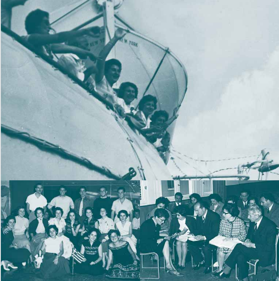
1955, Greek students aboard the Independence . 1960s, Fulbright teacher training seminar.